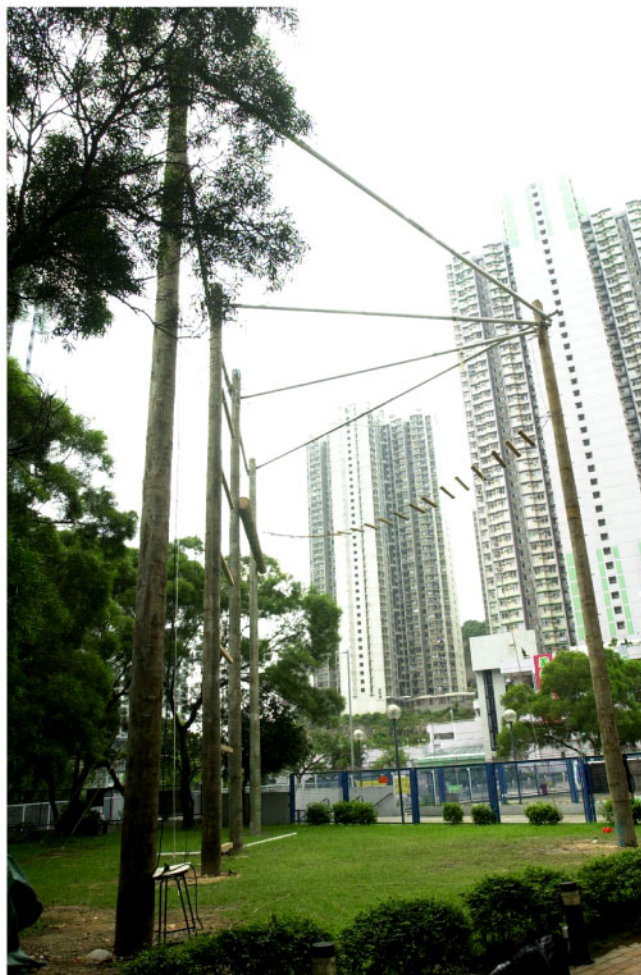
Challenge Course in YMCA (New Territories Centre) built by Haac.